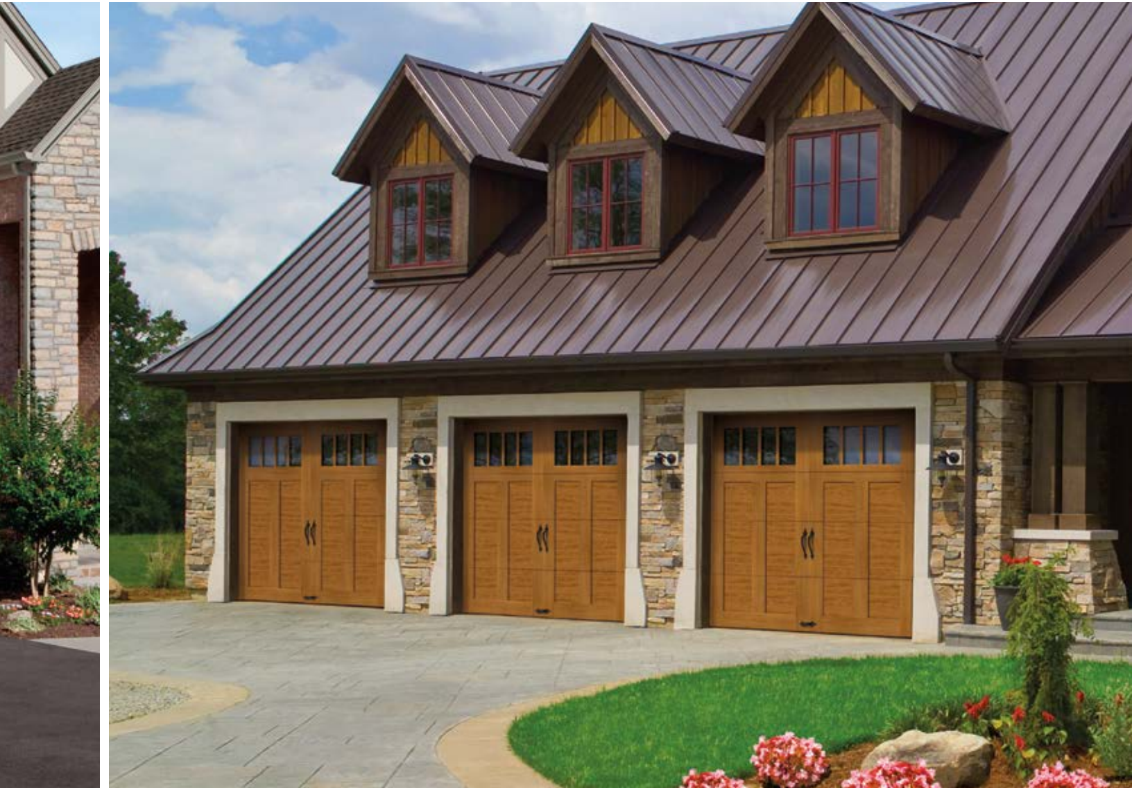
Canyon Ridge® Collection Ultra-Grain® Series Design 12 Shown in Medium Finish with Clear Cypress Overlays and REC14 Window Design (Model CAN212NCREC14).