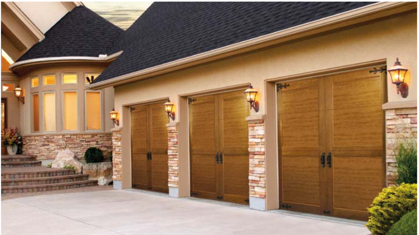
Canyon Ridge® Collection Ultra-Grain® Series Design 36 Shown in Medium Finish with Clear Cypress Overlays and TOP11 (Solid) Top Section (Model CAN236NCTOP11).