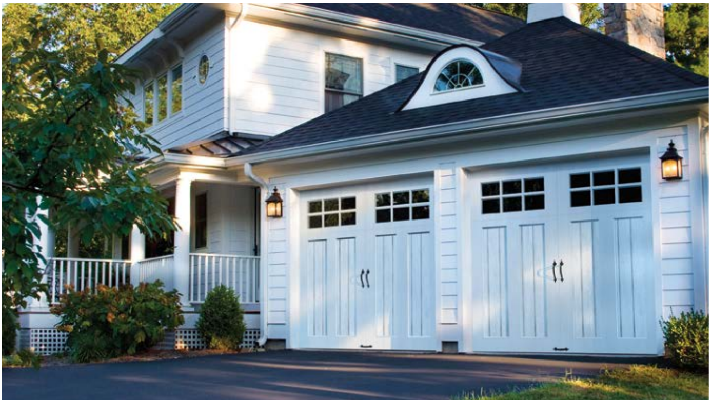
Canyon Ridge® Collection Limited Edition Series Design 12 Shown in Whitewash Finish with Mahogany Cladding, Mahogany Overlays and SQ23 Window Design (Model CAN212MMSQ23).

Note: Cladding and Overlay material options may be mixed and matched.