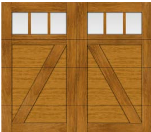
Canyon Ridge® Collection Ultra-Grain® Series Design 22 Shown in Medium Finish with Clear Cypress Overlays and REC13 Window Design (Model CAN222NCREC13).

An attractive and more economical alternative to the Limited Edition Series, this door features a 2" Intellicore® polyurethane insulated steel base door with Ultra-Grain®, a durable, natural-looking, woodgrain paint finish. Stained Clear Cypress composite overlays are applied to the steel door surface to create beautiful carriage house designs.