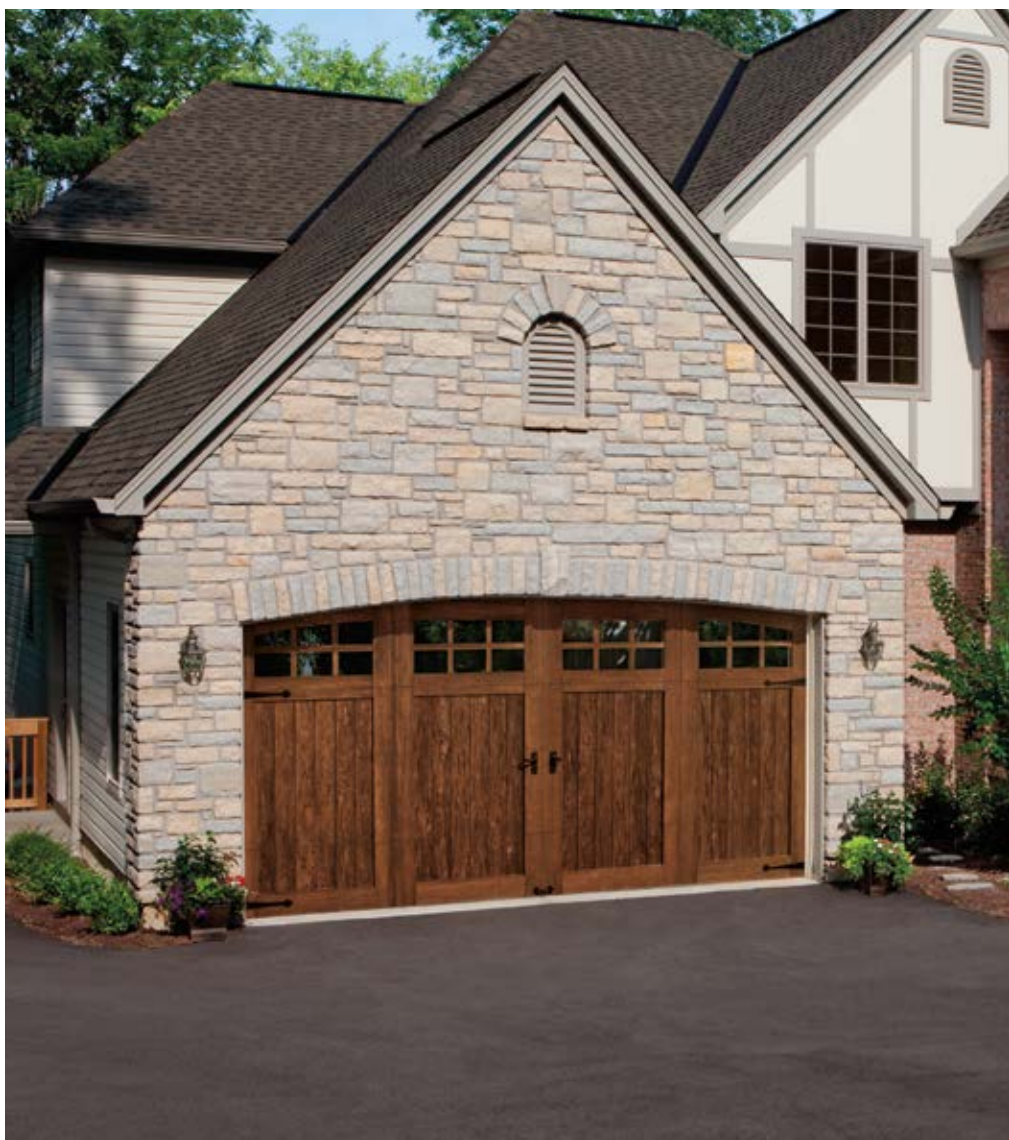
Canyon Ridge® Collection Limited Edition Series Design 11 Shown in Dark Finish with Pecky Cypress Cladding, Clear Cypress Overlays and ARC3A Window Design (Model CAN211PCARC3A).

Clopay's extensive selection of faux overlays, designs, windows, decorative hardware and finish colors can complement any home style and budget.