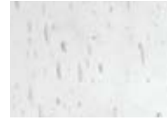
Seeded glass option available on all window designs.

Top sections are available in solid panels or with windows in Rectangular, Square and Arched Designs. 1/8" DSB glass is standard. Obscure, Seeded, Insulated DSB, Insulated Obscure and Insulated Seeded are also available options. Glass available on Series 1 and 2 only.