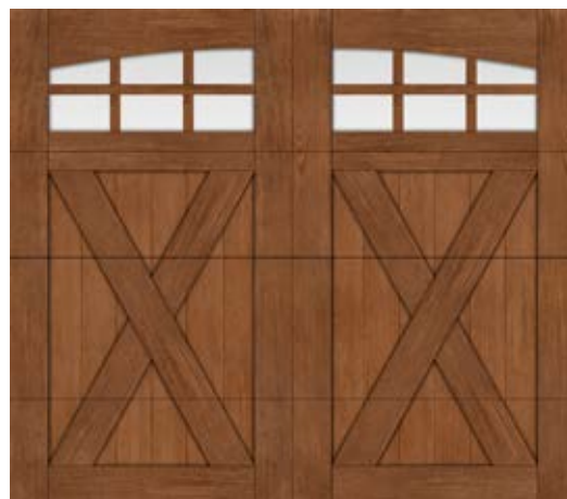
Canyon Ridge® Collection Limited Edition Series Design 21 Shown in Dark Finish with Clear Cypress Cladding, Clear Cypress Overlays and ARCH3 Window Design (Model CAN221CCARCH3).