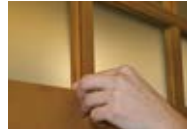
Attractive beveled edge clip-in grilles are removable for easy cleaning.